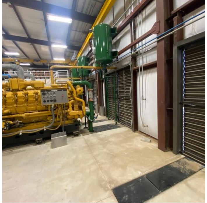
View from the opposite end of the generator room. The foreground is set up to receive the fourth generator.