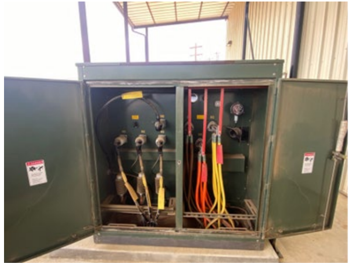
Each unit is equipped with a transformer