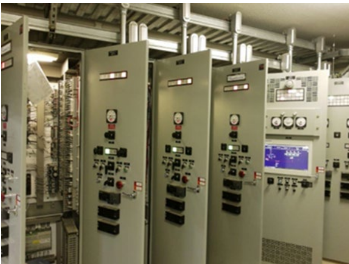
View of Control Panels in the control room