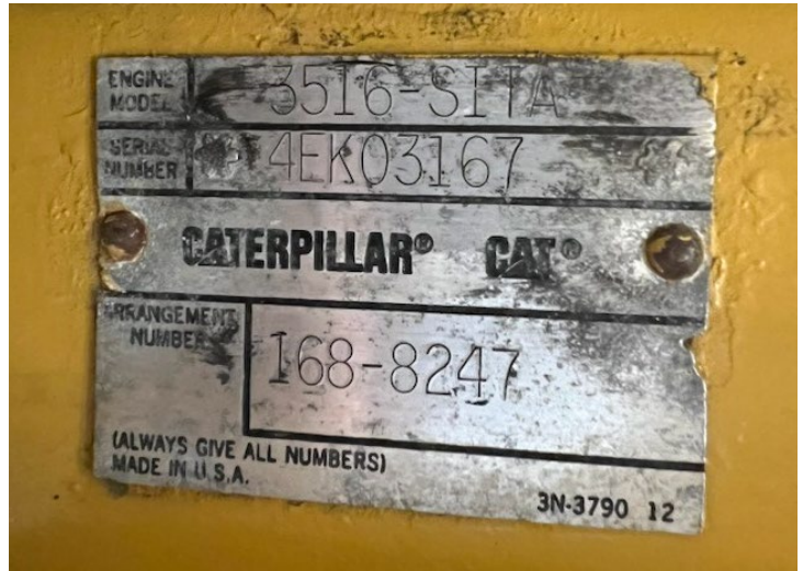
Engine #2 Plate