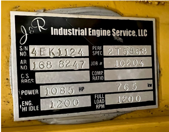
Engine #3 Plate