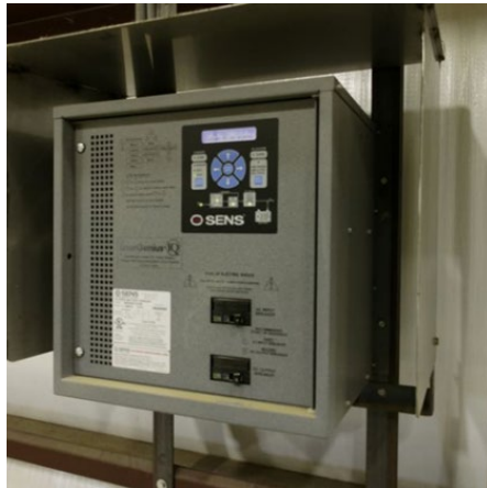
Trickle charger; each generator is equipped with one.