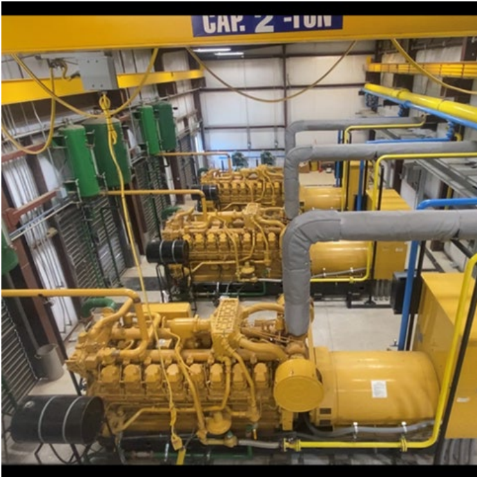
View from the mezzanine. GREEN indicates Water. YELLOW indicates Natural Gas. Blue indicates Air.