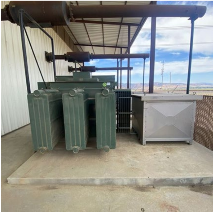
Outside the back of the building where the four transformers and exhaust silencers are located.