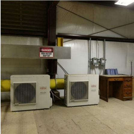
View of two air condition units on mezzanine