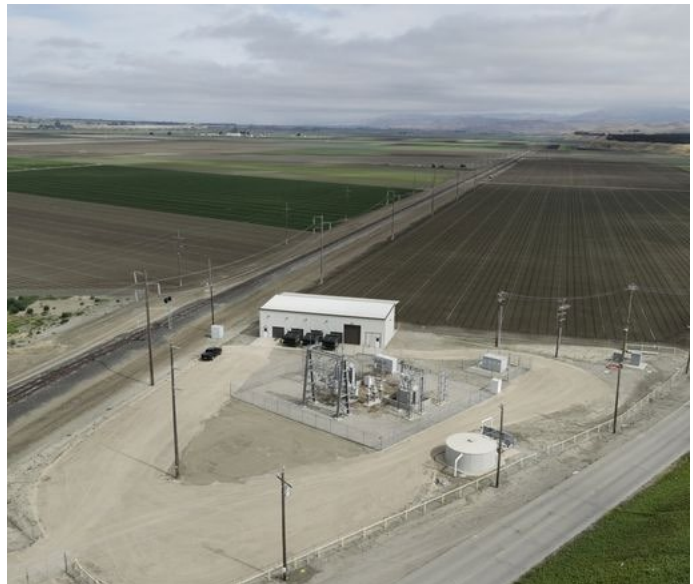
Drone view of the entire facility. The building and everything inside of it are included in this sale. The coolers and the transformers located directly outside the building are also included in the sale.