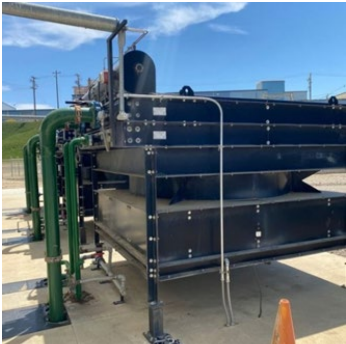
Side view of the coolers.