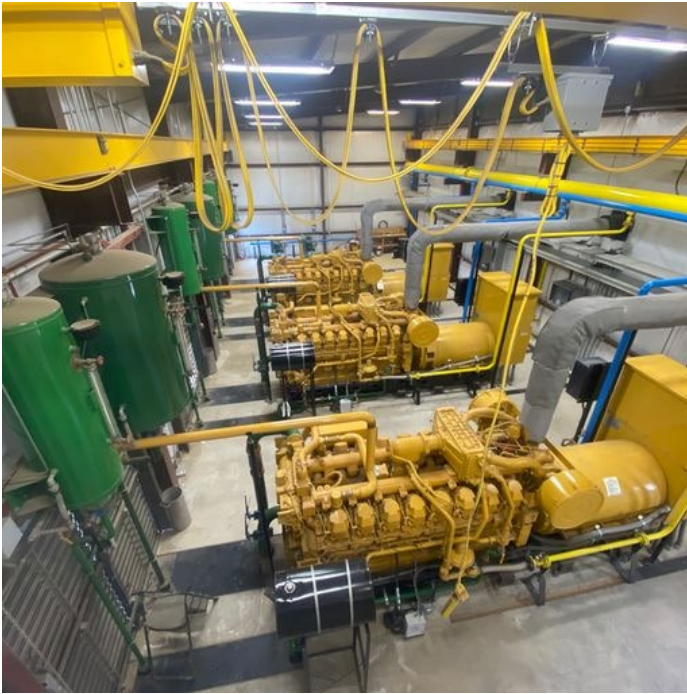
View of generators from the mezzanine.