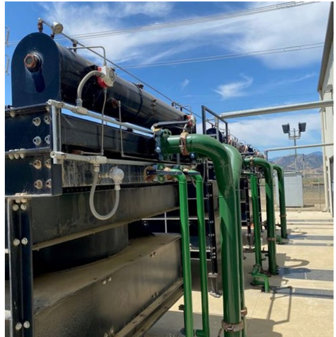
View of water coolers on the front side of the building.