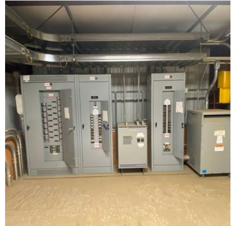
Breaker Boxes are located on the mezzanine.