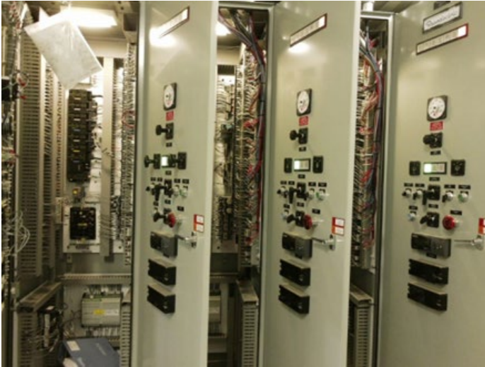
View of Control panels. The control room is equipped with the necessary panels for four generators