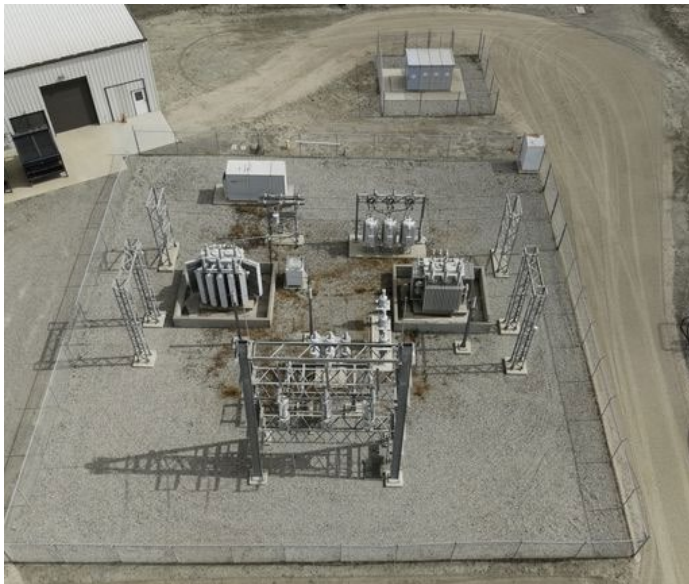
Drone view of equipment that is NOT included. The equipment inside the two fenced-in areas are not included in this sale.