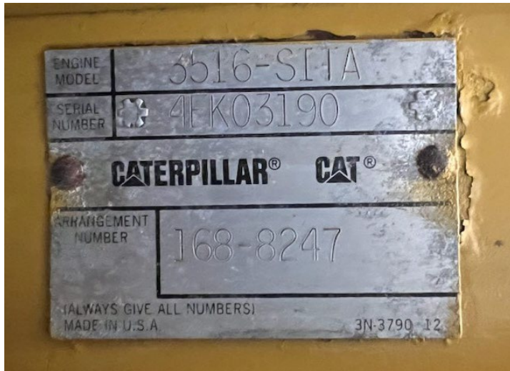
Engine #1 Plate