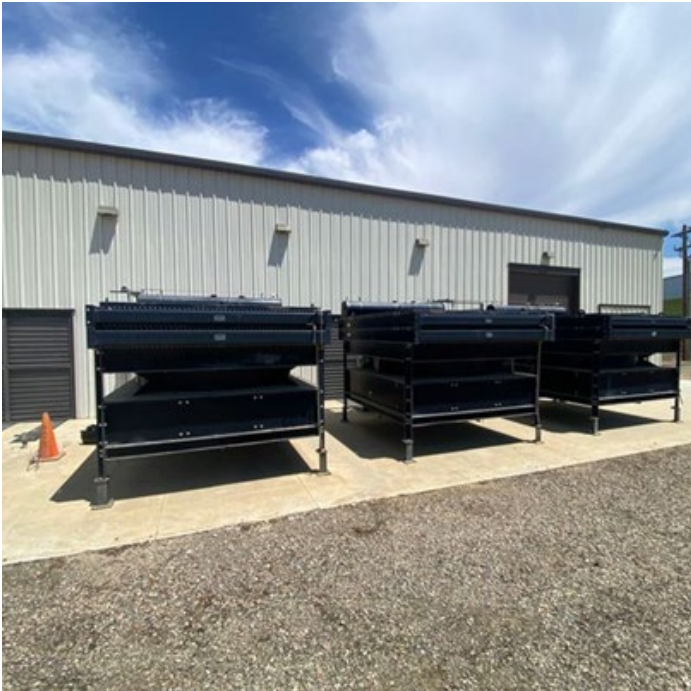
Engine Jacket water/auxiliary water coolers are located outside the front of the building. To the left is the open spot for the fourth cooler.