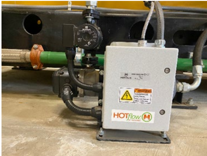
Kim HotStart – One for each unit