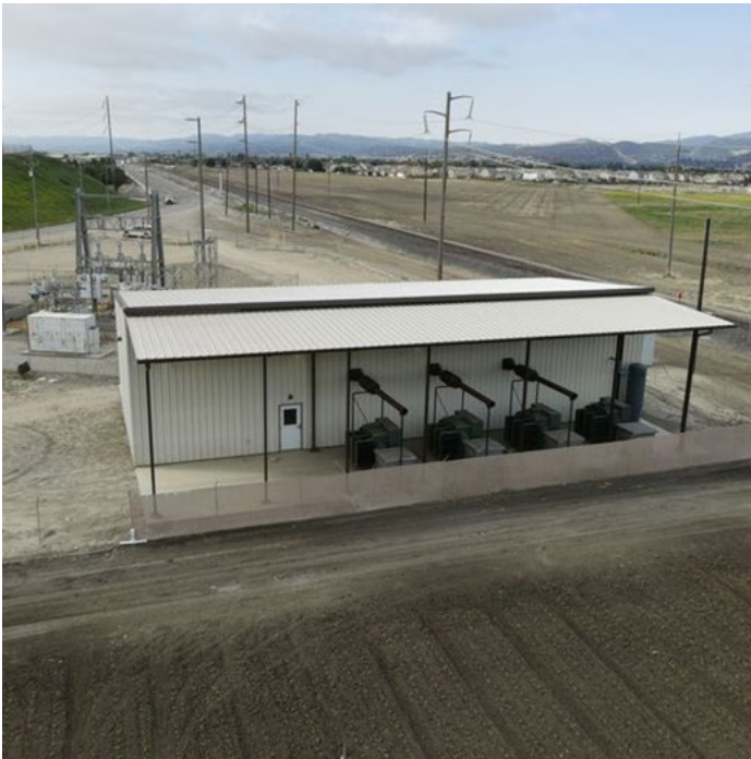
Drone view of the entire building from the back side showing the four transformers and three exhaust silencers