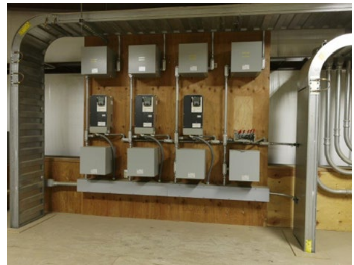
VFDs for cooler motors – in the mezzanine above the control room